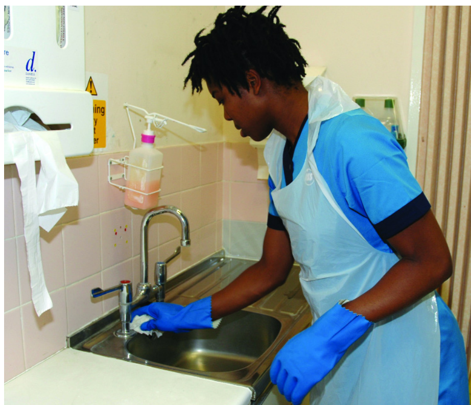
FIGURE 1 Domestic cleaning around sink.

There is new evidence highlighting that the hospital environment becomes contaminated with microorganisms responsible for HCAI. However, whilst the presence of the same strain of microorganism in the environment as those infecting/colonising patients demonstrates that the environment becomes contaminated with microorganisms from patients, it does not provide confirmation that the environment is responsible for contamination of patients. Transmission of